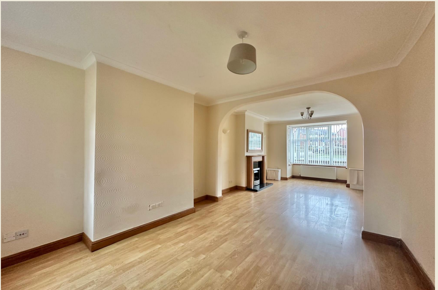
LIVING DINING ROOM 24'8 x 11'0