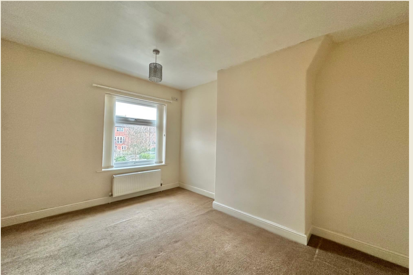
BEDROOM TWO & BEDROOM THREE